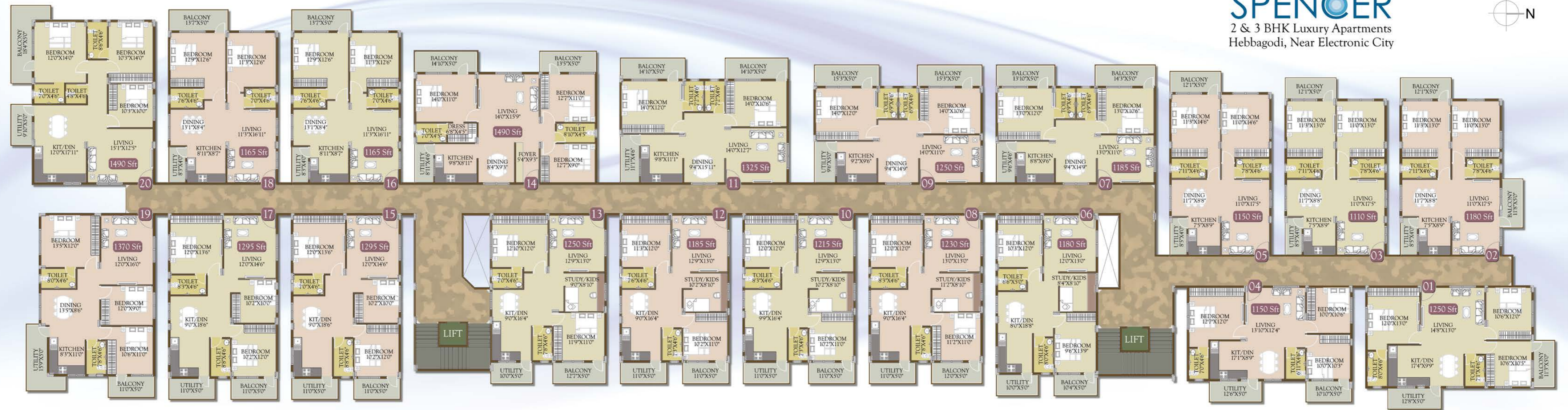
TYPICAL FLOOR PLAN - (GROUND, FIRST, SECOND & THIRD FLOOR)